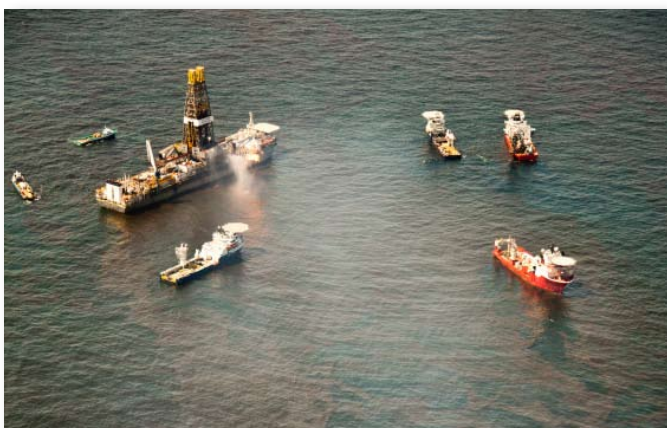
Deepwater Horizon Flyover

Before the Deepwater Horizon disaster, the Obama Administration announced it would seek to open up the Eastern Gulf of Mexico (stretching from the Florida Panhandle to the Keys) to offshore oil and gas drilling, which have been off limits to drilling for many years. After the BP spill, however, the Obama Administration reversed its position, citing safety and environmental concerns, and has not gone until recently with proposals to open up the Eastern Gulf to offshore lease sales. 19 On November 8, 2011 the Obama Administration announced it will open previously restricted areas of the Gulf of Mexico to oil drilling. 20