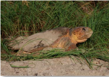
Loggerhead Turtle, Melbourne Beach

Florida is home to a number of marine plants and animals whose populations are declining and imperiled. State and federal agencies such as the U.S. Fish and Wildlife Service, National Marine Fisheries Service, and the Florida Fish and Wildlife Conservation Commission (FWC) have worked together to protect these species and aid their recovery under federal and state law. Both federal and state governments are necessary to adequately protect the state's imperiled species since their rules focus on different aspects of species preservation. Under the federal Endangered Species Act (ESA), potential impacts are weighed against the health of the species throughout its entire range, which may extend beyond the state boundaries. The state focuses on the status of the population within Florida. Populations stabilized nationally might still be declining within Florida, or vice versa, so both the federal and state designations are important for safe-guarding imperiled species.