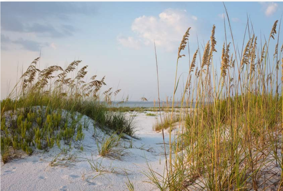
Sea oats and san dunes, Florida

The Florida Coastal and Ocean Coalition created this second, updated Blueprint, Florida's Coastal and Ocean Future: An Updated Blueprint for Economic and Environmental Leadership , to inform state leaders and the public of current issues affecting Florida's environment, economy, and citizens. This report addresses many continuing and some new issues affecting Florida's coastal and marine environments since 2006, and also recommends specific actions to improve the environmental and economic health of Florida's natural resources.