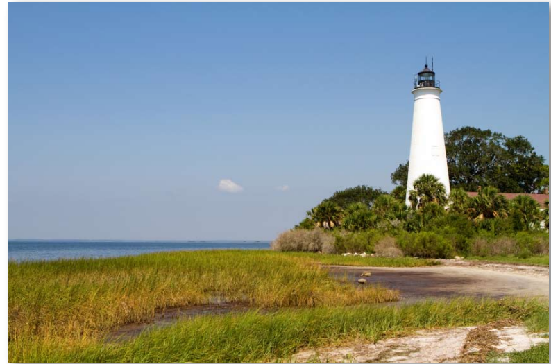
Lighthouse at St. Marks National Wildlife Refuge, Florida

Coastal tourism and recreation are two of Florida’s top ocean industries, 1 and both depend on healthy ecosystems. In Florida, having abundant fish and wildlife, public access to beaches and state parks, and clean rivers, springs, bays, and oceans is a matter of economic survival. The state needs a strong framework to best manage these resources to ensure their long-term health and economic return. Without a guiding framework, Florida risks more overdevelopment, a serious decline in our quality of life, degraded coastal waters, the loss of valuable fish and wildlife, and the heavy cost of ecosystem restoration and recovery.