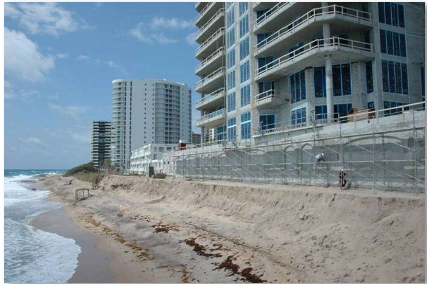
New Construction on Critically-Eroding Beach Singer Island, Florida