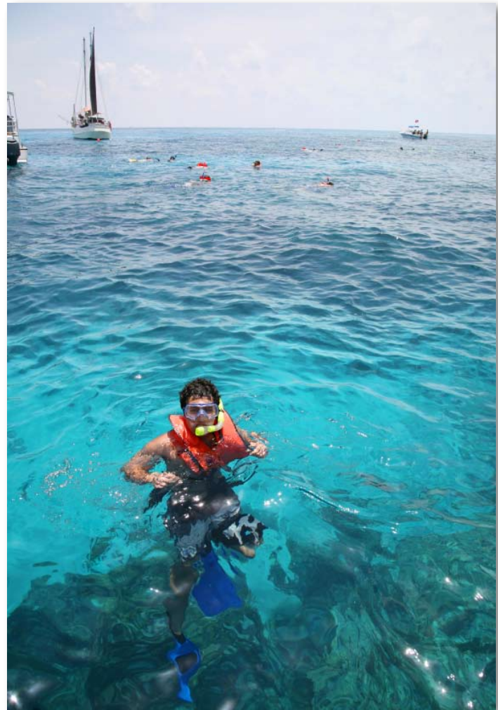
Snorkeling above soft coral in Bahia Honda State Park, Florida

We are only just beginning to understand some of the other threats faced by this rare and fascinating ecosystem. Overharvesting of reef fish and other predators is affecting the reefs, as is ocean warming and acidification, which alters the environment for calcium-carbonate reef builders like coral. Scientists are exploring other chemical and physical stressors, including the effect that extensive touching by divers and snorkelers has on the reefs, as well as sunscreen residue released into the water. Also of concern are increasingly clear linkages between human sewage pollution and coral diseases. Both further research and vigorous protections are needed for this natural – and economically important – Florida treasure.