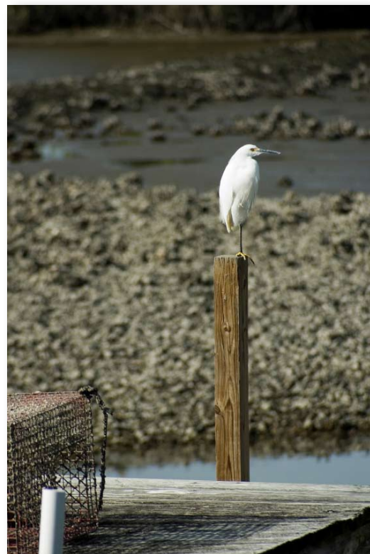
Snowy egret in oyster beds, Cedar Key

In addition to the commercial fisheries value, oyster reefs provide valuable ecosystem services including protecting shorelines from erosion from storm surges and waves, improving water quality, cycling nutrients, and serving as nursery and feeding area for many other commercially and recreationally valuable fish, crab and shrimp species. Yet more than 85% of the world's oyster reefs have declined, primarily due to overharvesting. 46 The Gulf of Mexico is the only region in the United States where oyster reefs are considered in fair condition (50-89% lost). Loss of oyster reefs threatens this valuable resource and the estuarine environment where they occur. Restoring oyster reefs for their full suite of ecological and economic services benefits oystermen, coastal communities and the state as a whole.