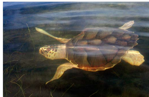
Juvenile Loggerhead Turtle, Indian River Lagoon

The economic damage of the oil spill to Florida’s fisheries and tourism economy has been substantial. To date, Florida has received the largest amount of paid economic damage claims from the Gulf oil spill - $2,230,267,740 out of a total of $5,466,287,765 paid for all Gulf Coast claims. 14 Numerous studies are underway as part of the Natural Resources Damages Assessment process and by academic researchers to determine the short- and long-term effects of the spill on marine mammals, fisheries, deep coral, birds, sea turtles, seagrasses, oysters, marshes and other natural resources in the Gulf, as well as the loss of use by the public of those resources.