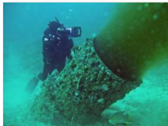
SE Florida Ocean Outfall Pipe