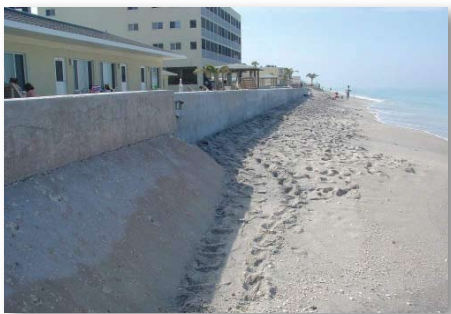
Turtle Tracks Along Sea Wall

In a typical beach nourishment project, sand is dredged offshore and piped onto the beach. A slurry of sand, shell, and water flows from the pipe onto the beach. Bulldozers then move this new sand on the beach and in the surf zone. While these projects provide protection to upland development from storm events, beach nourishment projects have other, damaging impacts, including siltation of coral reefs, turbidity, burial of essential fish habitat, steep “scarping” along the beach slope, loss of recreational surfing and diving as well as sand quality issues that can affect turtle nesting and beach habitat. 23