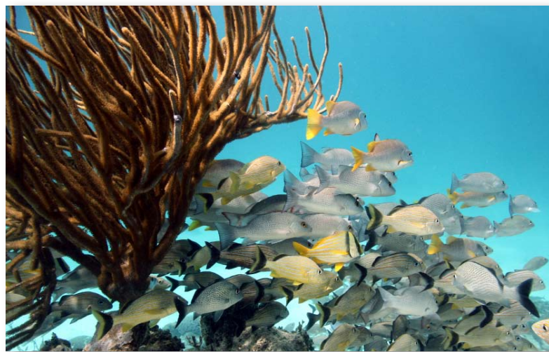
School of fish in coral reef, Gulf of Mexico

Under an April 2011 agreement between the NRDA trustees and BP, BP has agreed to provide $1 billion toward early restoration projects to speed up restoration in the Gulf of Mexico and to address injuries to natural resources caused by the spill. This agreement is a first step toward fulfilling BP's obligation to fund the complete restoration of injured public resources. The trustees announced on December 14, 2011, the selection of 8 initial projects (2 in Florida) to receive funds from the $1 billion Early Restoration Agreement. 16