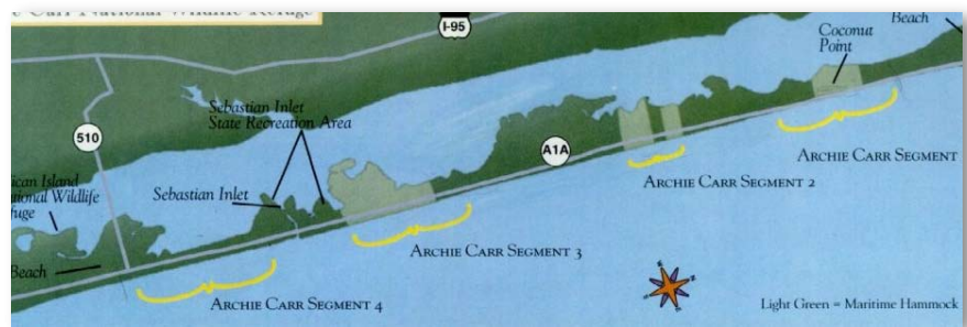
Archie Carr National Wildlife Refuge Melbourne Beach, Florida

The Florida Forever list includes a category entitled "climate change lands projects" that includes proposed coastal land acquisition projects. Consistent funding of Florida Forever is needed in order to ensure that these important projects can be acquired.