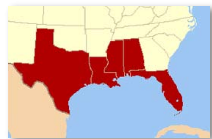
Gulf Coast states bordering Gulf of Mexico

Recognizing the importance of the Gulf of Mexico and its ecosystems, and in response to the Deepwater Horizon oil spill and the recommendations proposed in the Mabus Report, President Barack Obama established the Gulf Coast Ecosystem Restoration Task Force (Task Force) on October 5, 2010. The Task Force is charged with coordinating the long-term conservation and restoration of America’s Gulf Coast. The Task Force is made up of senior officials from seven federal cabinet agencies, the Executive Office of the President, and one representative each from the five Gulf Coast states of Alabama, Florida, Louisiana, Mississippi and Texas.